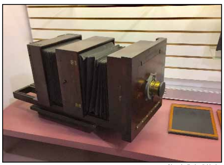
The Folmer-Graflex Enlarging/reducing copy camera on display.