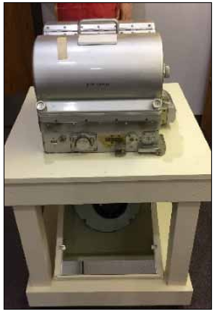
A T-11 Camera mounted on a stand with a mirror below to show the lens.