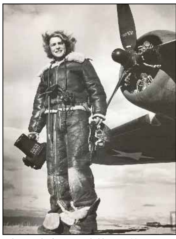
Photograph of an aviator holding a K-20 camera.

The eight by ten Folmer-Graflex Enlarging/reducing Copy Camera was made in Rochester, New York. It is a studio camera that has a double bellows, 8 by 10 ground glass back, and measures 38" by 18" by 16". It contains a Goerz Dagor f:6.8 12 inch focus lens.