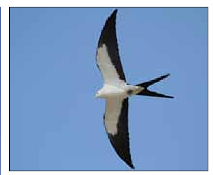
Swallow-tailed Kite in flight.

The striking appearance of the Swallow-tailed Kite also caught the attention of Native Americans. The Ioway, Menominee, Omaha, Winnebago, and other tribes viewed the kite as a sacred bird. They believed that it served as a messenger between humans on earth and the thunderbird deities that lived in the heavens. Thunderbirds were benevolent deities that could intervene in human affairs. Because of the kite's prowess in hunting, Native Americans associated the bird with bringing success in war. The same is true for the Peregrine Falcon which is also featured