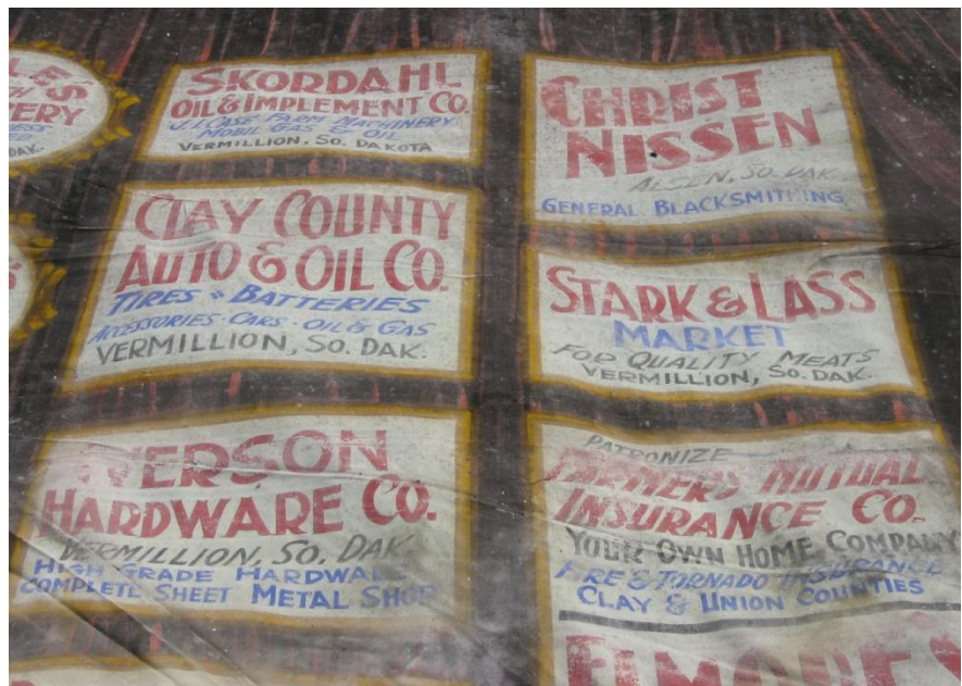
Garfield Township Hall Stage Curtain Advertisement

Of special interest to the CCHS is that the curtain also has the hand painted advertisements for 29 different businesses in in Clay County. The only business that is still in operation is Davis Drug. Although it was quite dusty and had a tear in the middle, the curtain is going to be restored at the W.H. Over Museum and then displayed on a wall for all to see.