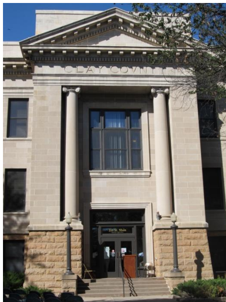
Clay County Courthouse 2012