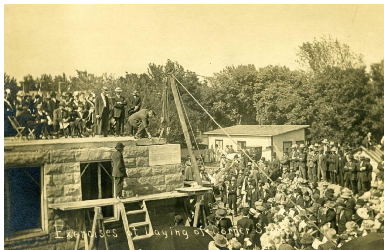
Laying of the Corner Stone at the Clay County Courthouse