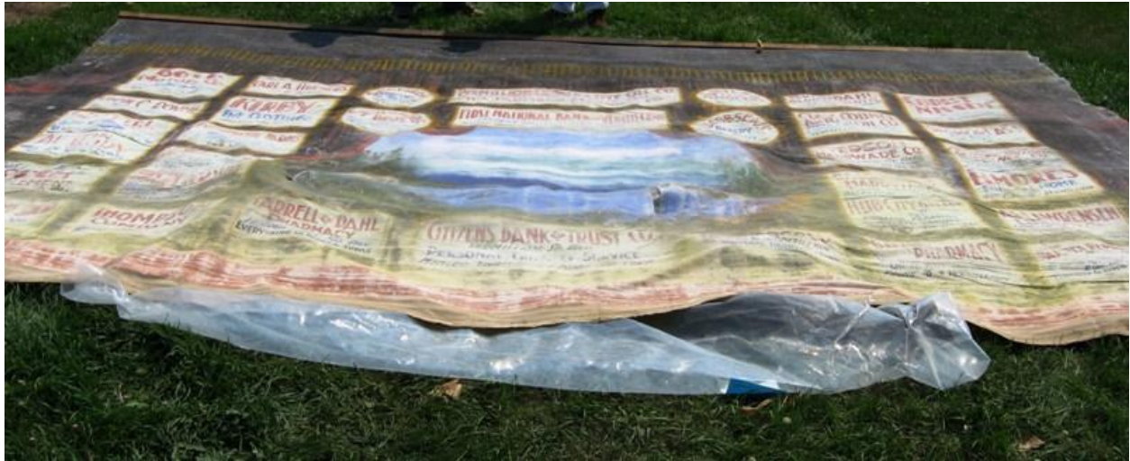
Garfield Township Hall Stage Curtain